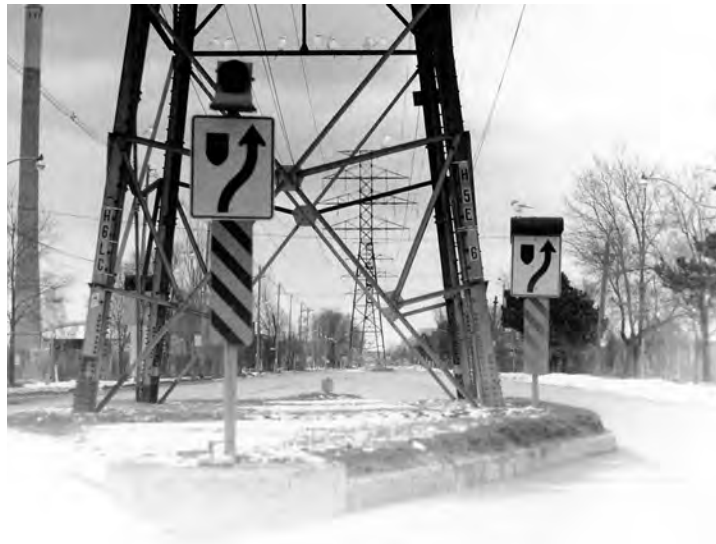
Untitled, from series Lost, Lila Yavari